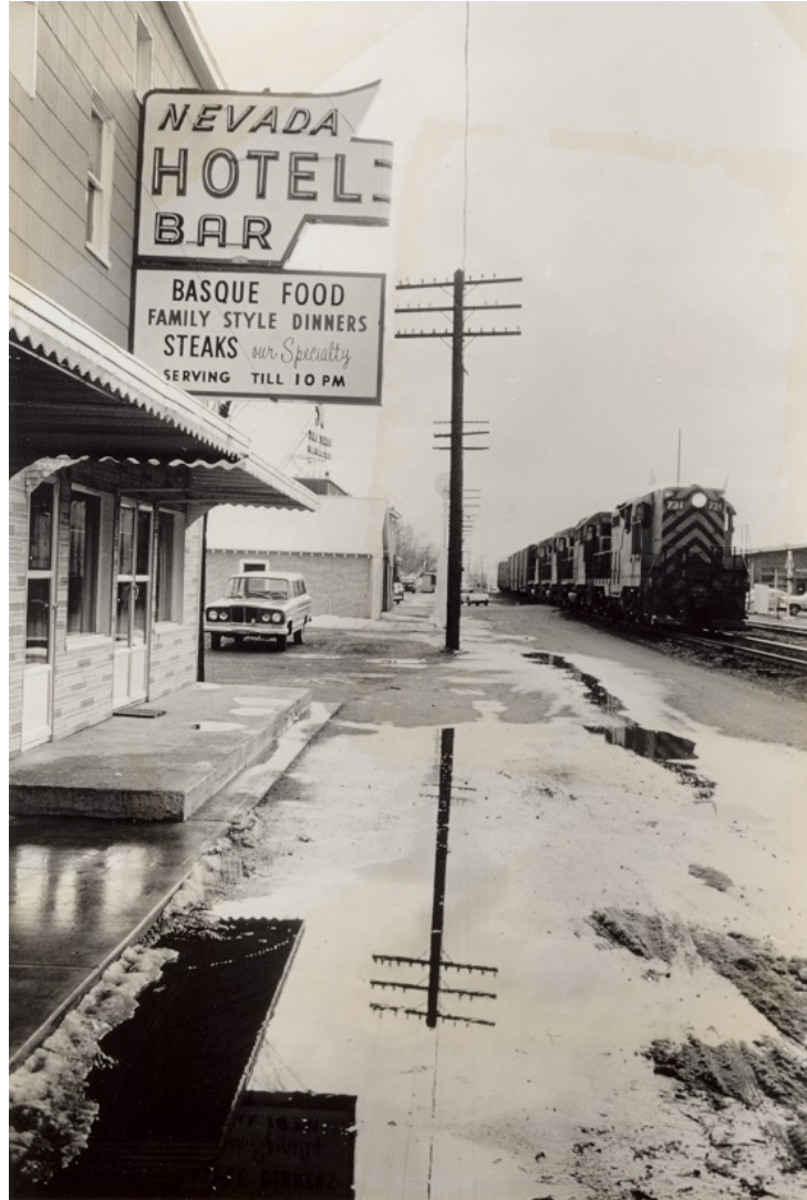
Jon Bilbao Basque Library, University of Nevada-Reno Library

Whitney Peak Hotel Reno, Nevada November 2-4 2017