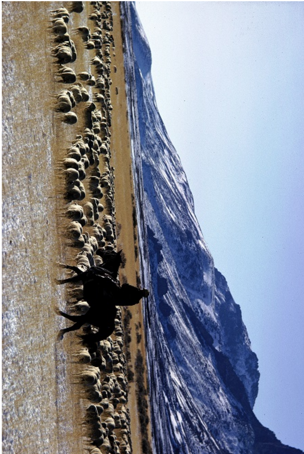
Jon Bilbao Basque Library, University of Nevada-Reno Library